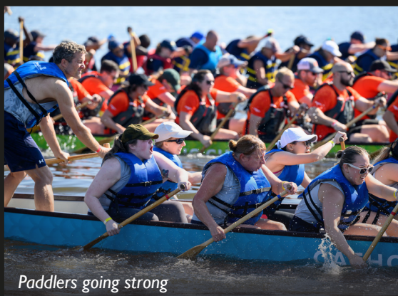
Paddlers going strong