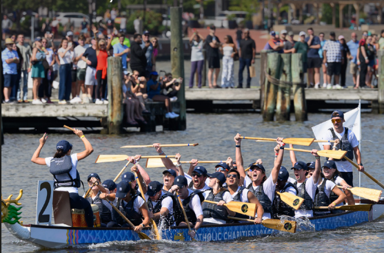
Brown Advisory celebrates a win

This year marked the 13th Biennial Dragon Boat Races, bringing together local businesses, nonprofits, and schools to compete for the coveted dragon trophy while raising more than $400,000 for Catholic Charities programs. Brown Advisory captured the Division A title, and the Archdiocese of Baltimore secured first place in Division B. A special thank you to our 2025 presenting sponsor, M&T Bank, for their continued partnership and support.