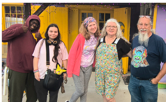
Clients and staff of Clubhouse

"We see treating trauma in kids as helping them make better choices as they age."