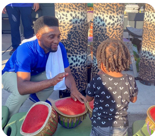
Mayor Scott playing drums with a child